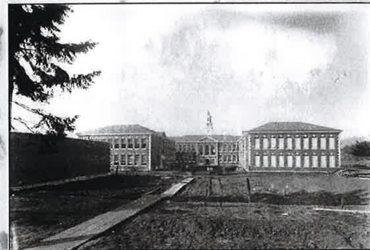
1915 photograph during construction of Franklin High School, looking north.